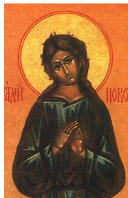
Venerable Arcadius of Vyazma and Novy Torg