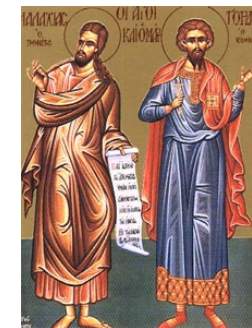
Martyr Gordius at Caesarea, in Cappadocia

MARTYR GORDIUS AT CAESAREA, IN CAPPADOCIA - The Martyr Gordius was born at the end of the third century in the city of Caesarea of Cappadocia into a Christian family. When he came of age, he entered military service. Because of his valor and military skill, he was made a centurion. During the persecution of Christians at the beginning of the fourth century, he left the world and settled in the Sinai desert to prepare himself for the good deed of confessing the Name of Christ the Savior. In the year 320, Gordius openly appeared before the prefect of a city where pagan games were being held, and identified himself as a Christian. He was arrested, suffered terrible torments, and then was beheaded.