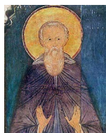
Saint Parthenius, Bishop of Lampsacus on the Hellespont