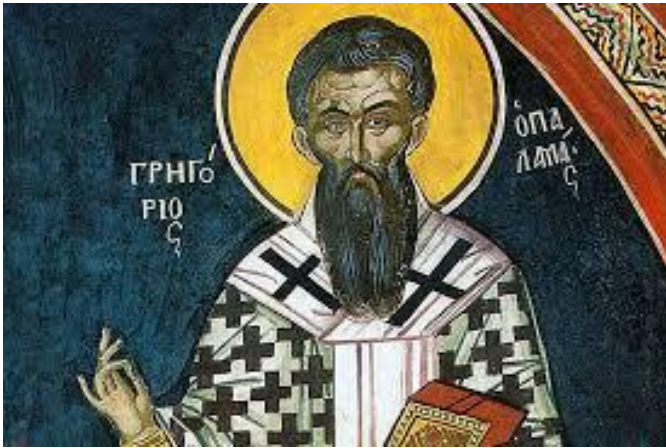
St. Gregory Palamas