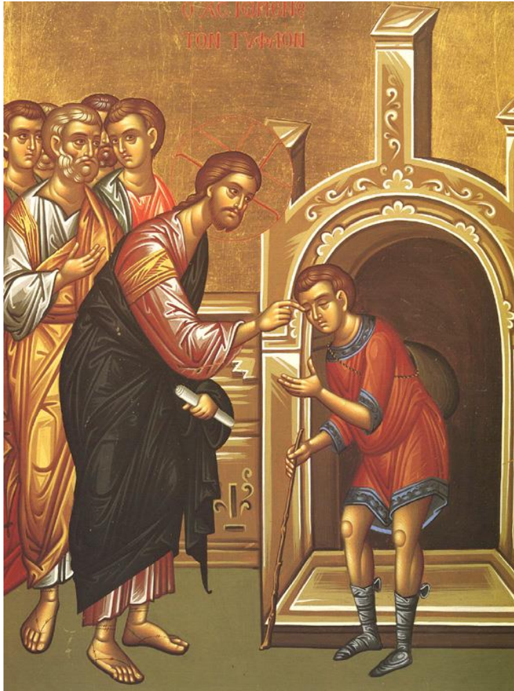
Sunday of the Blind Man

I come to You, O Christ, / Blind from birth in my spiritual eyes / And I call to You in repentance: / You are the most radiant light of those in darkness!